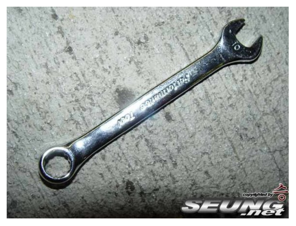
this is the key tool. (notice the #, it's 10mm.) make sure you have one, one that is as flat and short as possible.