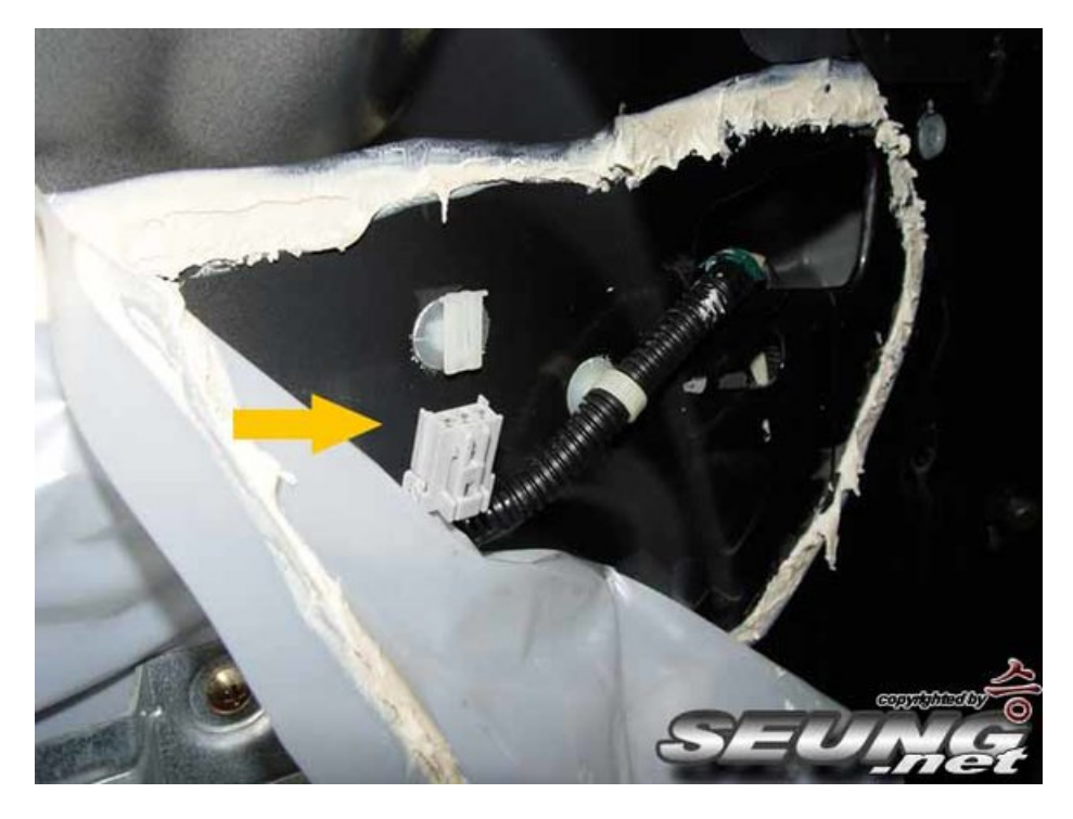
once you peel the plastic you'll see a wire socket for mirrors. remove it.