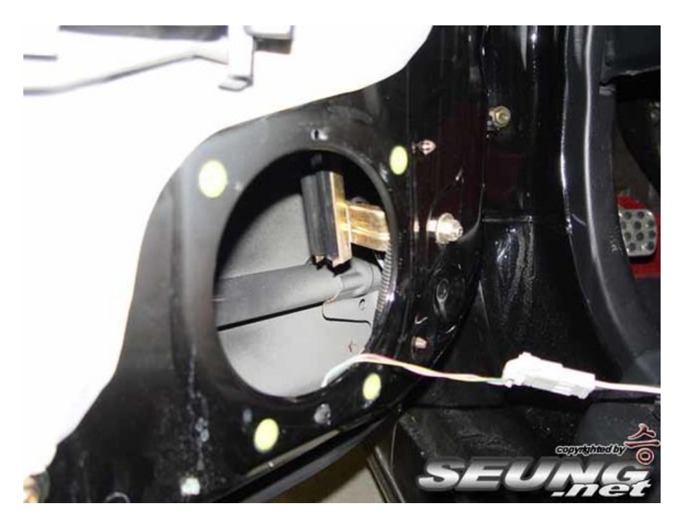
now remove the speaker.