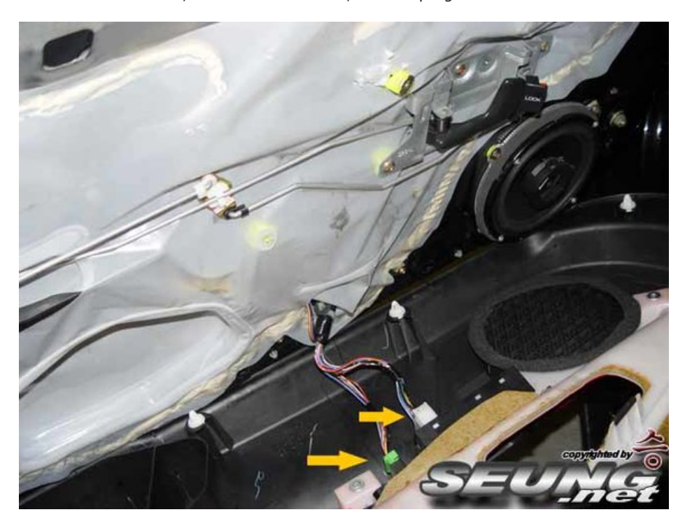
gently pull the door panel off, and remove two wire sockets, one for window control, and the other for mirror controls. (pass. side door panel has only one socket.)