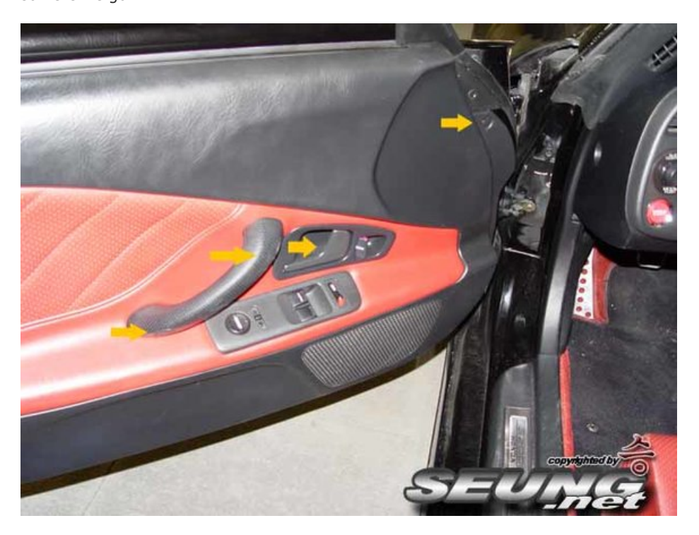
first remove the door panels... arrows indicate the tap/ bolts you have to remove. one behind door latch, two on door handles, and a tap right below the front of the window.