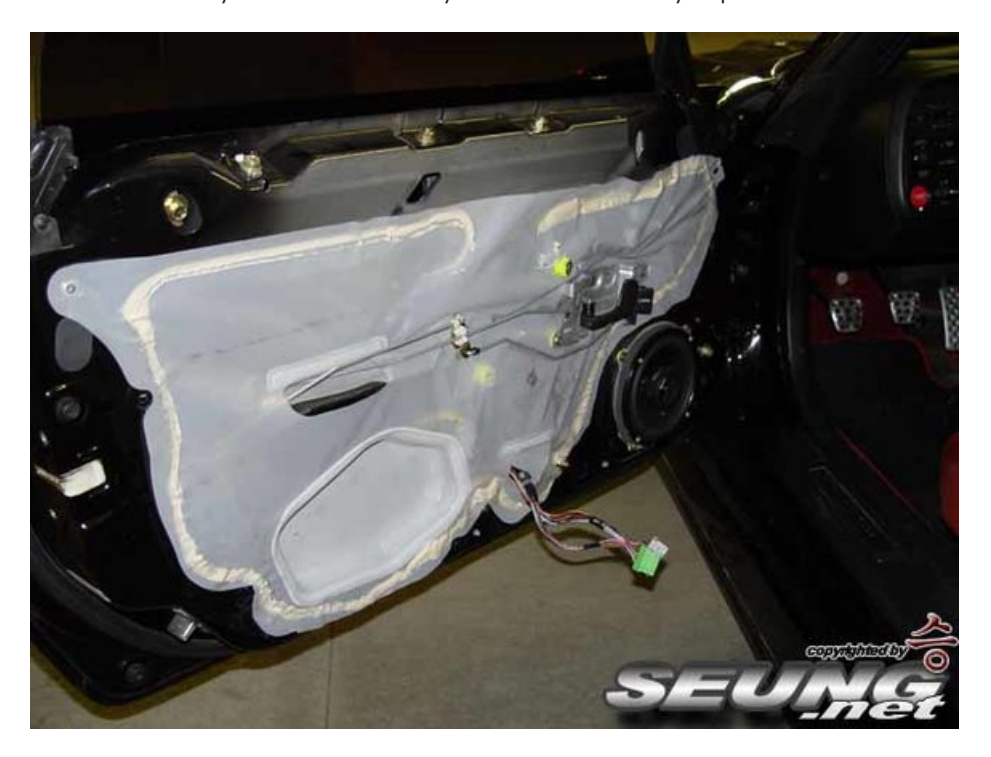
now pull the clear vinylly-plasticky thing off the door from front toward the back, about 15 inch or so. it's stuck with gooey glue shiet, it's nasty stuff so avoid getting it on your hand.

- before you remove the sockets, MAKE SURE YOU LOWER THE WINDOW ABOUT 1/3 THE LENGTH, but not all the way down. it will make your life easier when you put on the cs mirrors.